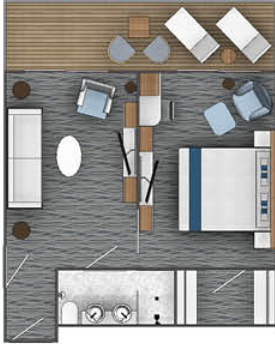
PS Premium Suite Size 45 m² | 485 ft²