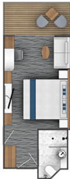
C Balcony State Cabin Size 24 m² | 259 ft²