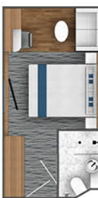
D Albatros State Cabin Size 22 m² | 237 ft²