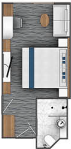
E French Balcony Cabin Size 16 m² | 173 ft²