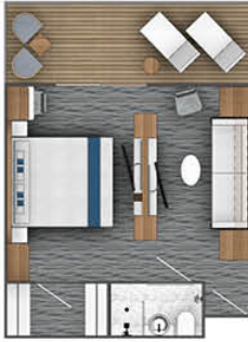
A Junior Suite Size Size 42 m² | 452 ft²