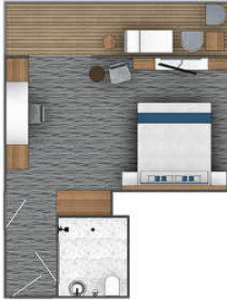
B1 Balcony Suite Size 35 m² | 377 ft²