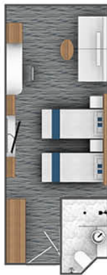
F Triple Cabin Size 22 m² | 237 ft²