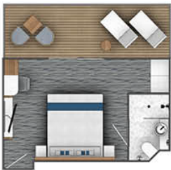
B2 Balcony Suite Size 28 m² | 302 ft²